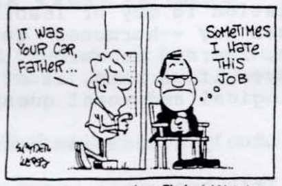
from The Joyful Noiseletter § 1991 Spyder Webb (Father Flood) Reprinted with permission