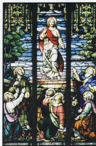
A CONTEMPLATIVE GUIDE TO THE WINDOWS AT ST. JOHN'S CHURCH, WEST TORONTO

Full details about St. John's windows available via: sjwt.ca/windows