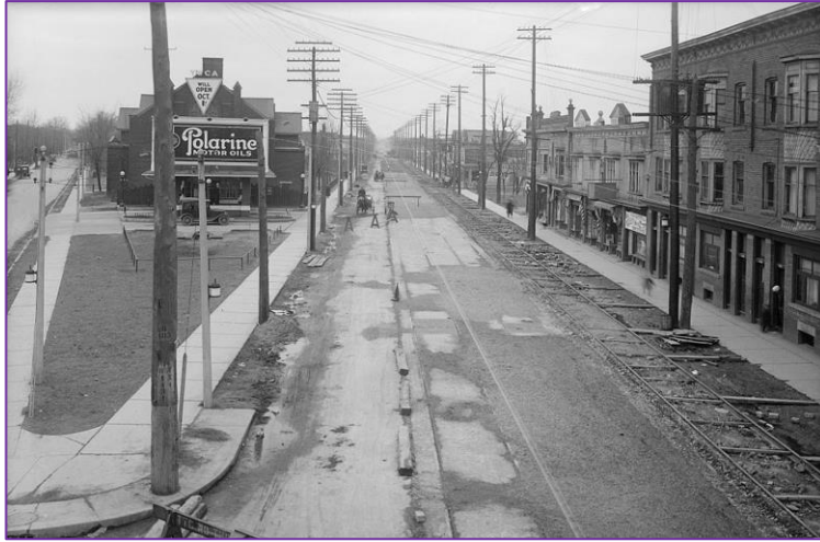
St. John's 2 nd church behind sign, Dundas & St. John's Rd., 1923

The history of St. John's, like the Junction area, has been shaped by its development as a transportation hub, first as a confluence of trails for the Indigenous community