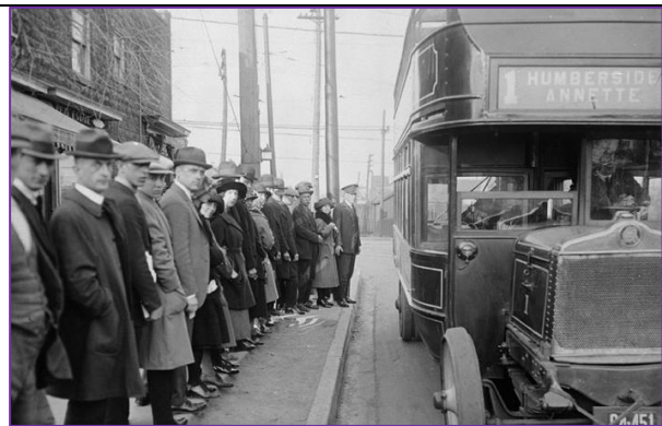
Waiting for the #1 bus, Humberside & Dundas St., 1923

Between 1921 and 1931, when St. John's celebrated its 50 th , Toronto's population had grown from 522,000 to 627,000, with much of that growth based in west Toronto