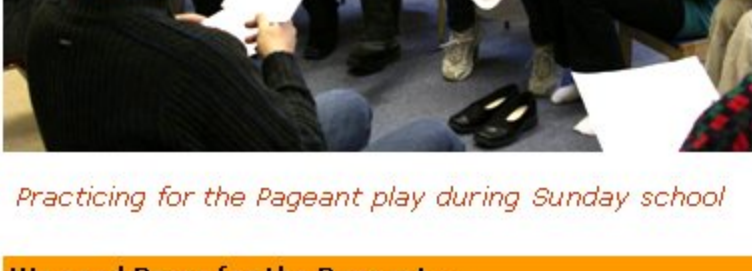
Practicing for the Pageant play during Sunday school