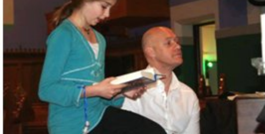
Singing Group Rehearsal for the Pageant