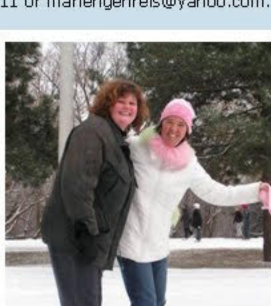
Skating Fun last year!