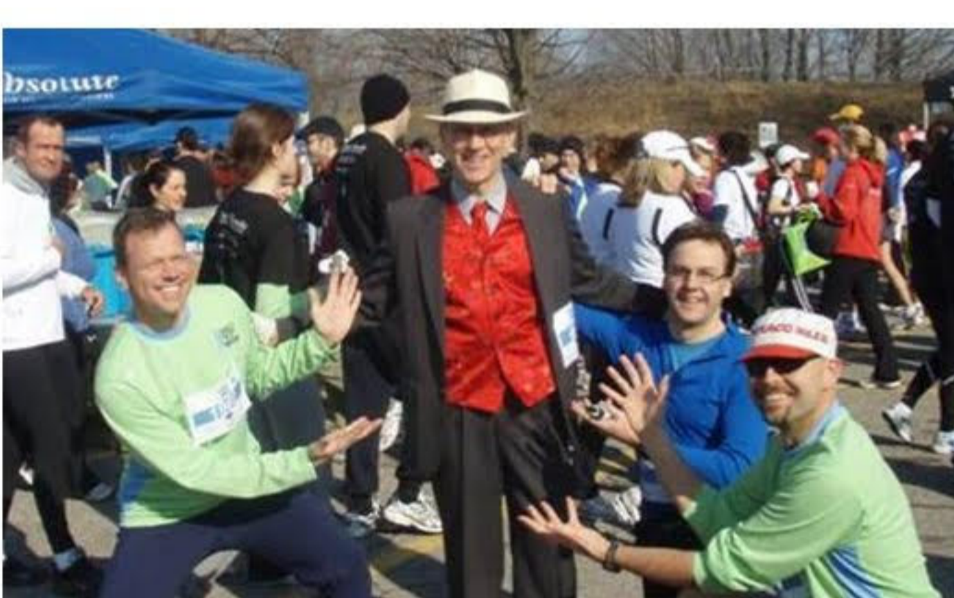
St. John's runners at the Harry's Spring Run-Off.