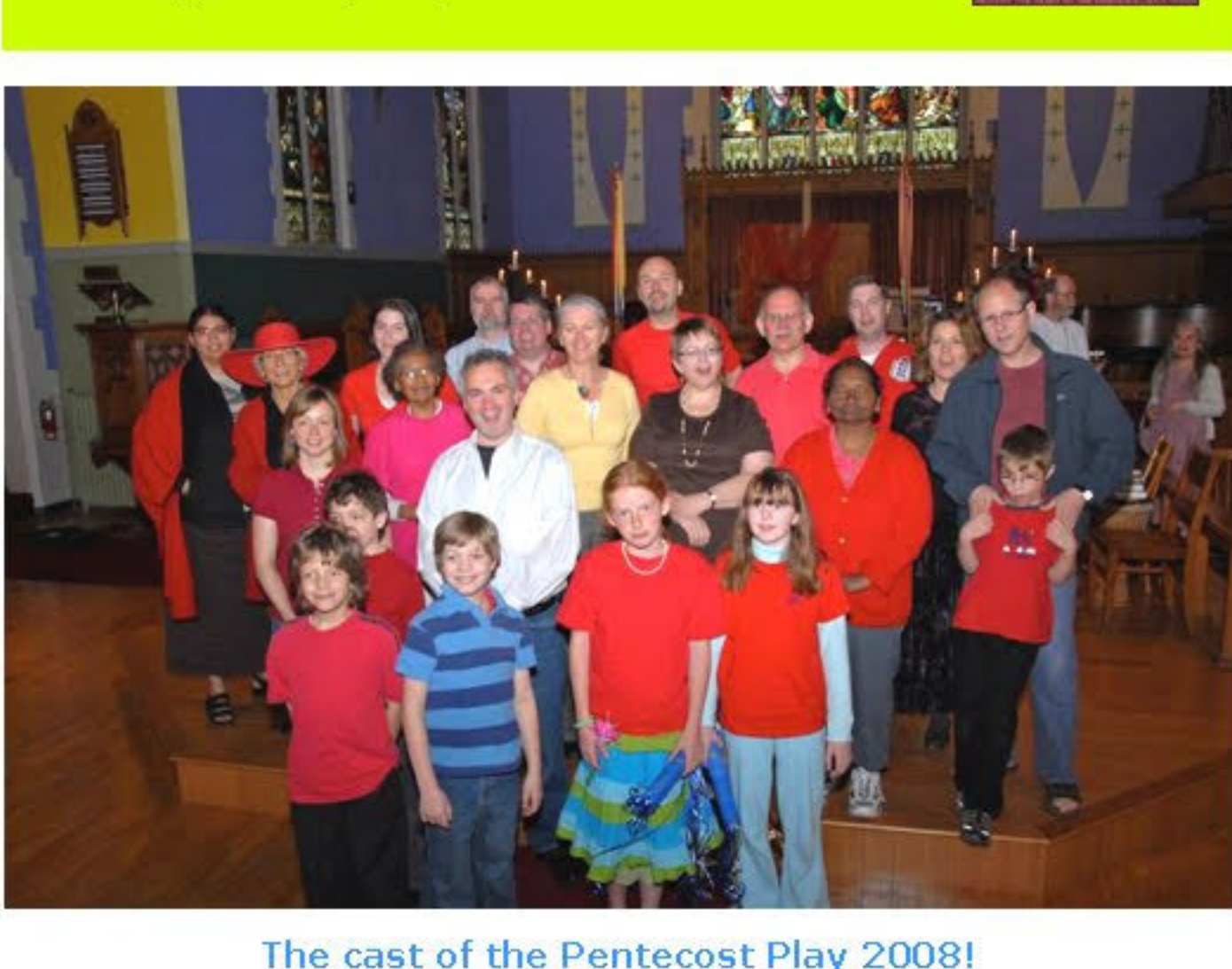
The cast of the Pentecost Play 2008!