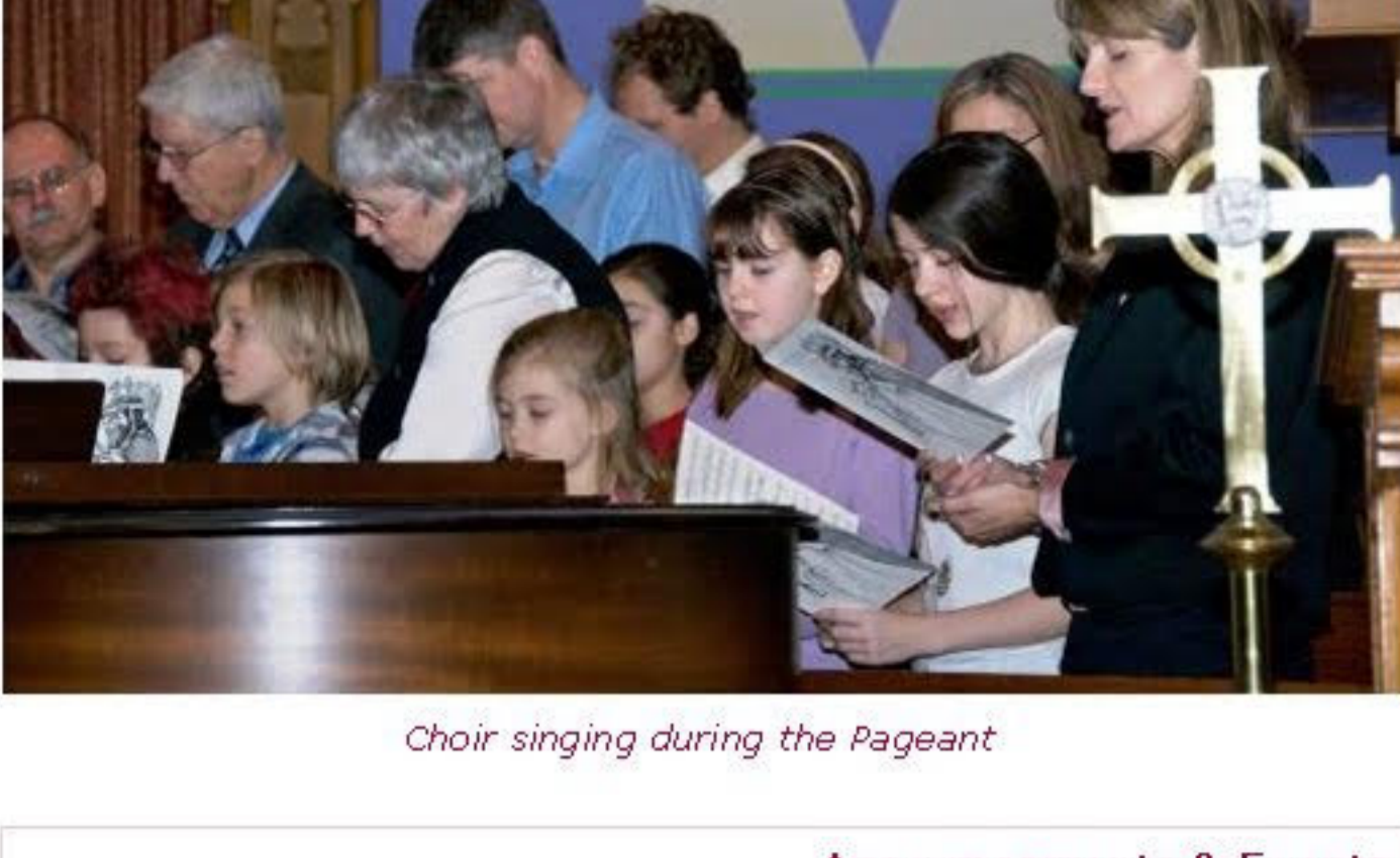
Choir singing during the Pageant

Worship with us this evening, December 24: Family Christmas Eve: December 24, at 5:30 p.m. The Traditional Christmas Eve service starts at 10:30 p.m. with a time for singing carols beginning at 10:00 p.m. Note: We will not have a service on Christmas Day.