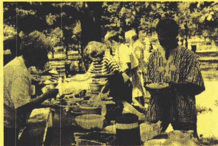
Plan to attend the 1994 Home Coming and put Yourself in the picture.