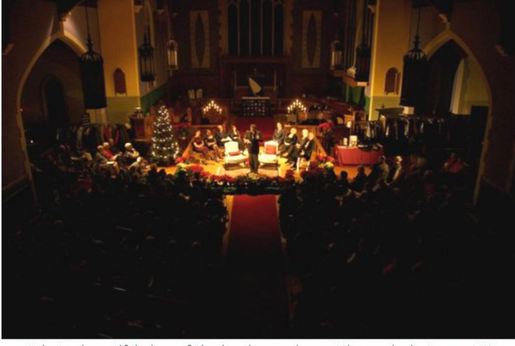
What a beautiful view of the lovely evening setting and what a cast!!!