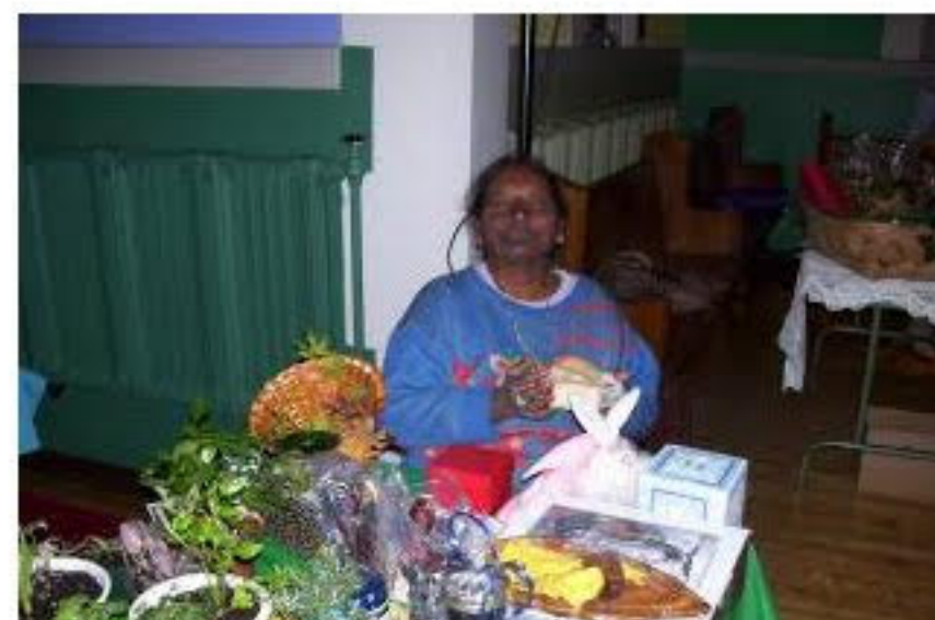
Indra sells plants