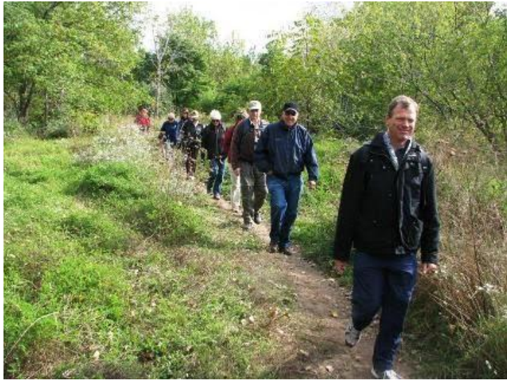
Last Saturday, we had wonderful weather for our Hike on the Bruce Trail. We started from the Brock Monument at Queenston, and concluded with a tasting at a winery. We held our earth blessing overlooking the lake and Toronto from the top of the Niagara Escarpment.